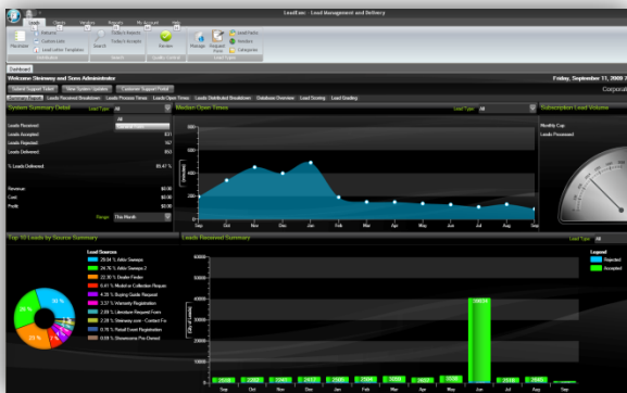
Example 1.1 LeadExec interface

Manage leads from affiliates, websites, banners, DirectTrack, and third party vendors.